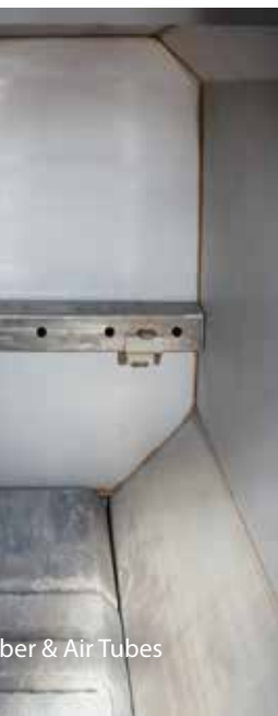
Water & Air Tubes

Air Tube Cleaning Whip: Equipped with a drill adapter, this 5' flexible rod will ensure your furnace is clean and running at peak performance.