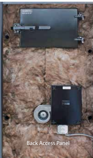
Back Access Panel